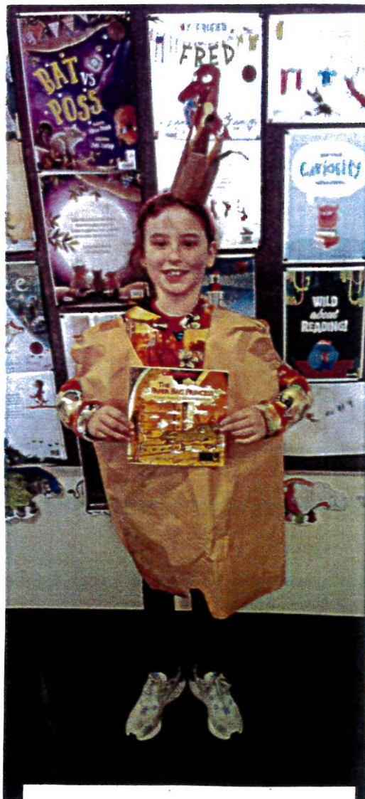
Elizabeth the Princess from "The Paper Bag Princess"

In celebration we dressed-up as favourite characters from a chosen book, and paraded at Assembly for our parents.